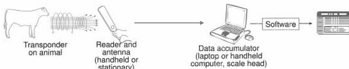
Figure 1. Basic components of an RFID system 6

extensive records, while others keep simple written records in a diary. Anytime a new technology is being considered for a ranch, it is valuable for the producer to determine how that technology will mesh with their current management system and their future goals. When considering investing in an electronic animal identification system, producers need to ask tough questions about their animal identification needs. How valuable will the information be to your operation and will you actually use the information to make improvements? Is it warranted to make the economic investment into a higher cost system when the market price signals may not justify the additional expense? 7