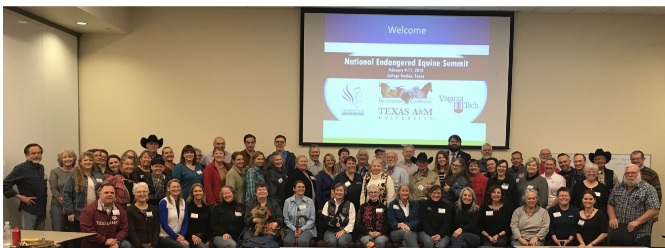
- National Endangered Equine Summit group, Texas A&M -