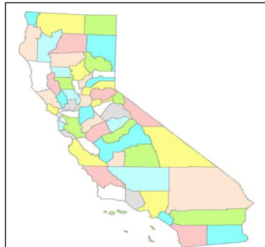
Figure 1. Trace mineral status of beef cattle in California counties was collected into a web page for increased accessibility.