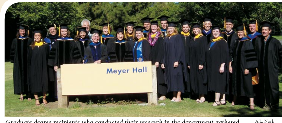
Graduate degree recipients who conducted their research in the department gathered with faculty on the lawn outside Meyer Hall before the Graduate Studies ceremony.

After its first full season of admissions activity, the ABGG now has 12 Ph.D. students and 47 M.S. students enrolled. The ABGG replaces the former Animal Science graduate program. http://animalbiology.ucdavis.edu